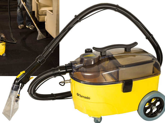
Marathon 350 Carpet Spotter